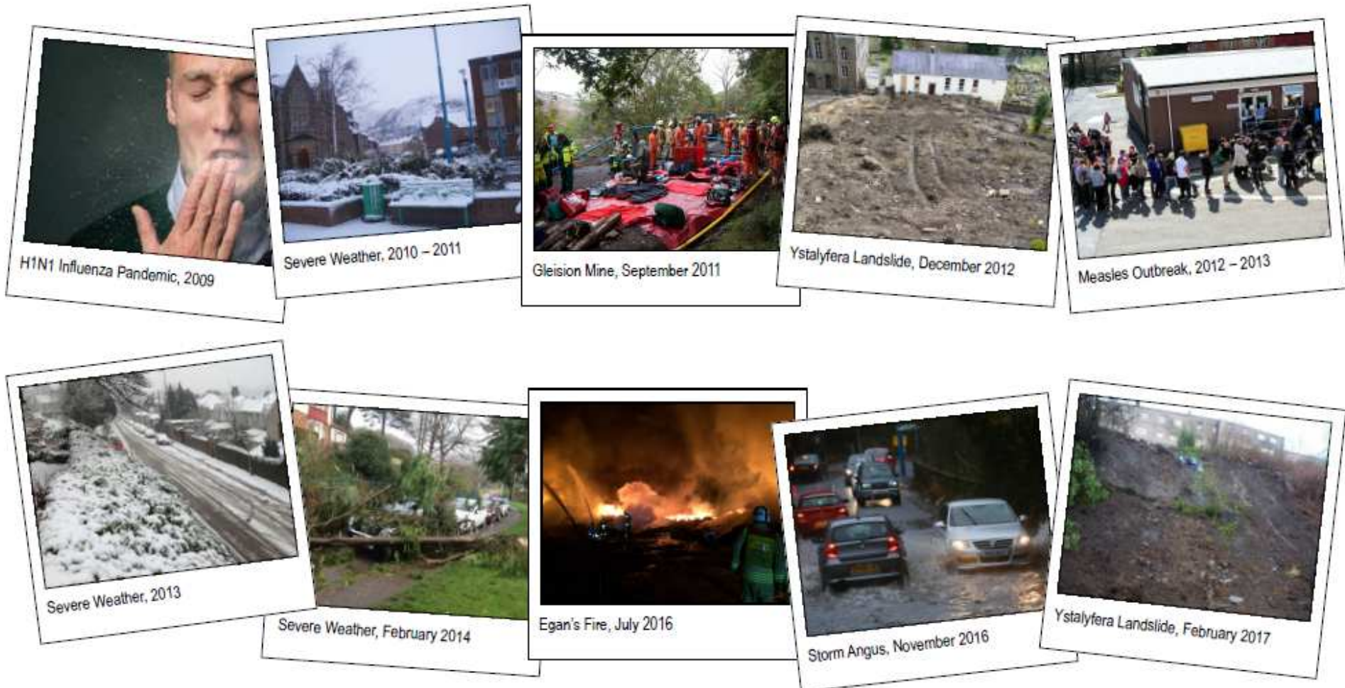
H1N1 Influenza Pandemic, 2009